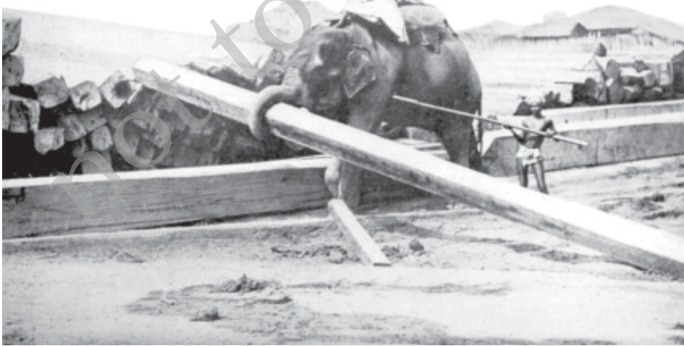
Fig.5 – Elephants piling squares of timber at a timber yard in Rangoon. In the colonial period elephants were frequently used to lift heavy timber both in the forests and at the timber yards.