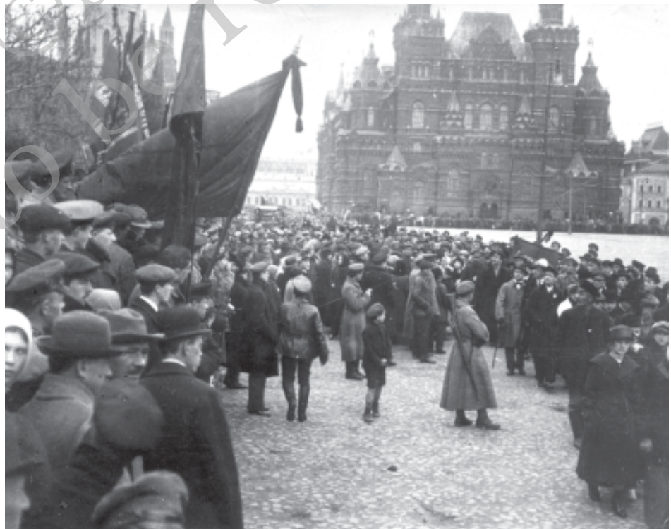
Fig. 13 – May Day demonstration in Moscow in 1918.