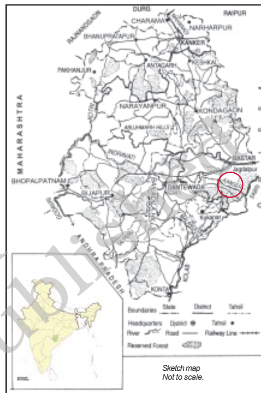
Fig.20 – Bastar in 2000.

Bastar is located in the southernmost part of Chhattisgarh and borders Andhra Pradesh, Orissa and Maharashtra. The central part of Bastar is on a plateau. To the north of this plateau is the Chhattisgarh plain and to its south is the Godavari plain. The river Indrawati winds across Bastar east to west. A number of different communities live in Bastar such as Maria and Muria Gonds, Dhurwas, Bhatras and Halbas. They speak different languages but share common customs and beliefs. The people of Bastar believe that each village was given its land by the Earth, and in return, they look after