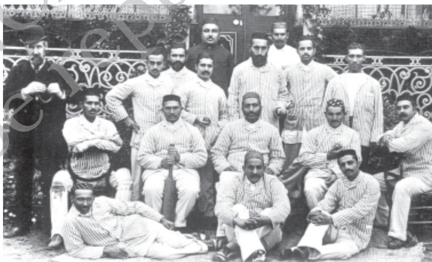
Fig. 13 – The Parsi team, the first Indian cricket team to tour England in 1886.

The establishment of the Parsi Gymkhana became a precedent for other Indians who in turn established clubs based on the idea of religious community. By the 1890s, Hindus and Muslims were busy gathering funds and support for a Hindu Gymkhana and an Islam Gymkhana. The British did not consider colonial India as a nation. They saw it as a collection of castes and races and religious communities and gave themselves the credit for unifying the sub-