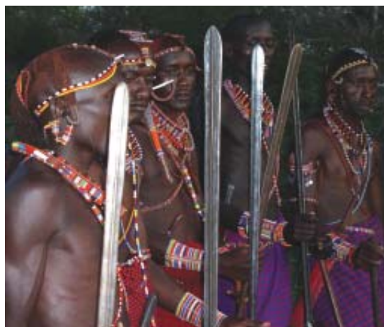
Fig. 16 – Note how the warriors wear traditional deep red shukas, brightly beaded Maasai jewelry and carry five-foot, steel tipped spears. Their long pleats of intricately plaited hair are tinted red with ochre. As per tradition they face East to honour the rising sun. Warriors are in charge of society's security while boys are responsible for herding livestock. During the drought season, both warriors and boys assume responsibility for herding livestock.

In Maasailand, as elsewhere in Africa, not all pastoralists were equally affected by the changes in the colonial period. In pre-colonial times Maasai society was divided into two social categories – elders and warriors. The elders formed the ruling group and met in periodic councils to decide on the affairs of the community and settle disputes. The warriors consisted of younger people, mainly responsible for the protection of the tribe. They defended the community and organised cattle raids. Raiding was important in a society where cattle was wealth. It is through raids that the power of different pastoral groups was asserted. Young men came to be recognised as members of the warrior class when they proved their manliness by raiding the cattle of other pastoral groups and participating in wars. They, however, were subject to the authority of the elders.