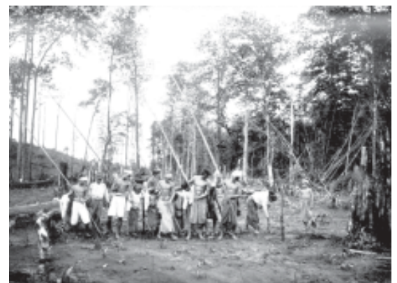
Fig. 15 – Taungya cultivation was a system in which local farmers were allowed to cultivate temporarily within a plantation. In this photo taken in Tharrawaddy division in Burma in 1921 the cultivators are sowing paddy. The men make holes in the soil using long bamboo poles with iron tips. The women sow paddy in each hole.

Children living around forest areas can often identify hundreds of species of trees and plants. How many species of trees can you name?