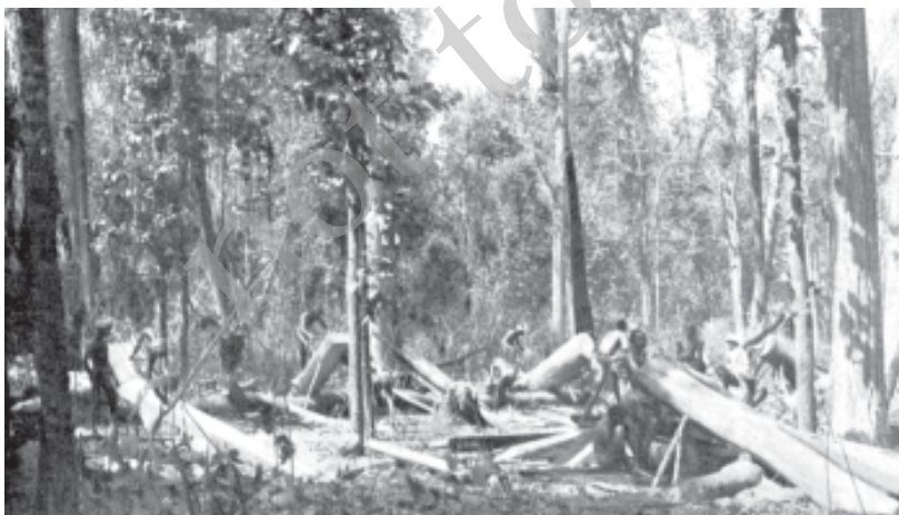
Fig.3 – Converting sal logs into sleepers in the Singhbhum forests, Chhotanagpur, May 1897.

Adivasis were hired by the forest department to cut trees, and make smooth planks which would serve as sleepers for the railways. At the same time, they were not allowed to cut these trees to build their own houses.