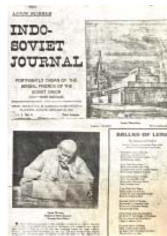
Fig. 20 – Special Issue on Lenin of the Indo-Soviet Journal. Indian communists mobilised support for the USSR during the Second World War.