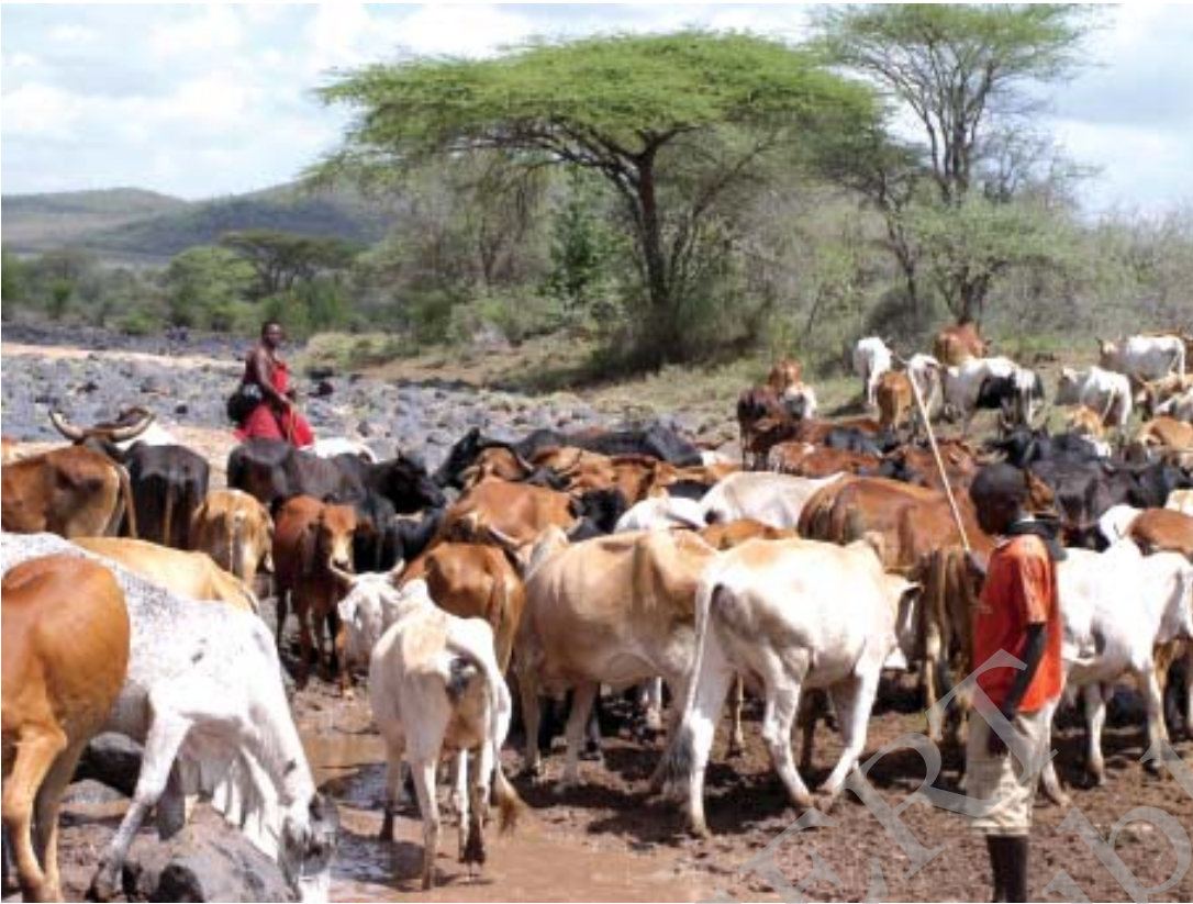
Fig. 15 – The title Maasai derives from the word Maa. Maa-sai means 'My People'. The Maasai are traditionally nomadic and pastoral people who depend on milk and meat for subsistence. High temperatures combine with low rainfall to create conditions which are dry, dusty, and extremely hot. Drought conditions are common in this semi-arid land of equatorial heat. During such times pastoral animals die in large numbers.