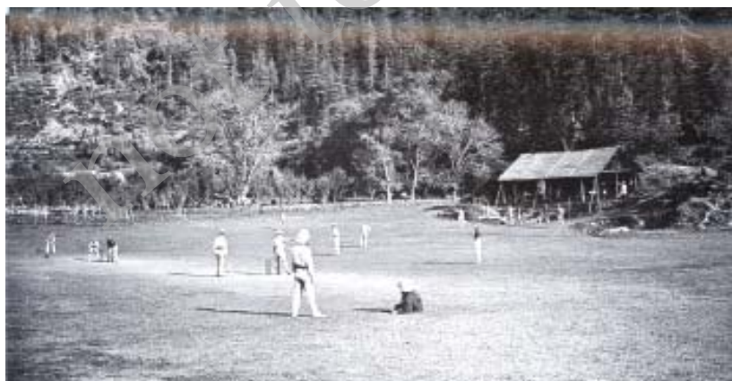
Fig. 10 – A leisurely game for recreation, being played against the backdrop of the Himalayas. The only Indians in the picture seem to be the servants seen near the pavilion.