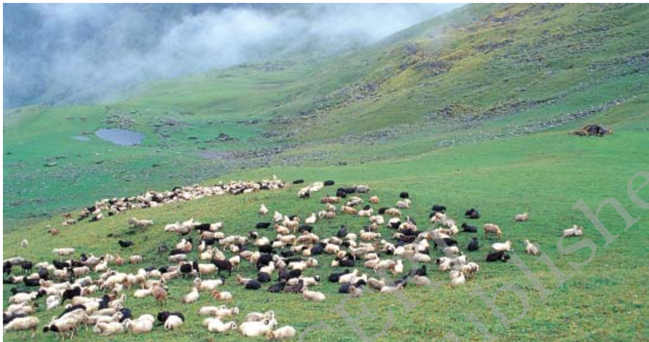
Fig. 1 – Sheep grazing on the Bugyals of eastern Garhwal.

Bugyals are vast natural pastures on the high mountains, above 12,000 feet. They are under snow in the winter and come to life after April. At this time the entire mountainside is covered with a variety of grasses, roots and herbs. By monsoon, these pastures are thick with vegetation and carpeted with wild flowers.