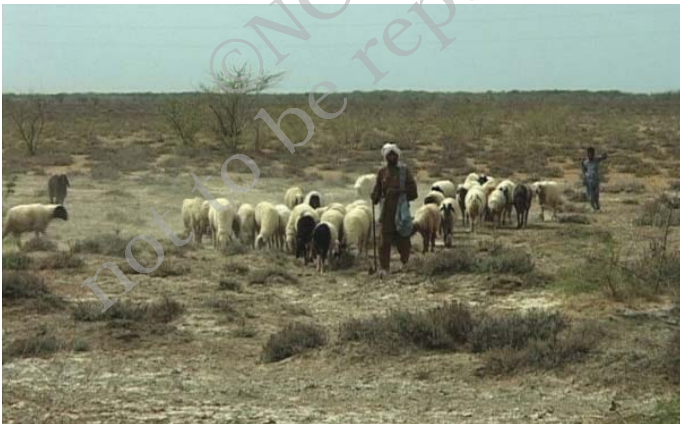
Fig. 10 – Maldhari herders moving in search of pastures. Their villages are in the Rann of Kutch.

The genealogist recounts the history of the community. Such oral traditions give pastoral groups their own sense of identity. These oral traditions can tell us about how a group looks at its own past.