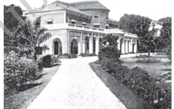
Fig. 11 – The Imperial Forest School, Dehra Dun, India. The first forestry school to be inaugurated in the British Empire. From: Indian Forester , Vol. XXXI

Foresters and villagers had very different ideas of what a good forest should look like. Villagers wanted forests with a mixture of species to satisfy different needs – fuel, fodder, leaves. The forest department on the other hand wanted trees which were suitable for building