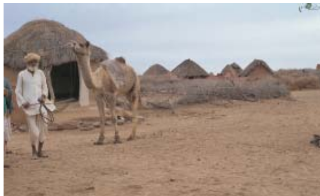
Fig. 6 – A camel herder in his settlement. This is on the Thar desert near Jaisalmer in Rajasthan. The camel herders of the region are Maru (desert) Raikas, and their settlement is called a dhandi.

In the deserts of Rajasthan lived the Raikas. The rainfall in the region was meagre and uncertain. On cultivated land, harvests fluctuated every year. Over vast stretches no crop could be grown. So the Raikas combined cultivation with pastoralism. During the monsoons, the Raikas of Barmer, Jaisalmer, Jodhpur and Bikaner stayed in their home villages, where pasture was available. By October, when these grazing grounds were dry and exhausted, they moved out in search of other pasture and water, and returned again during the next monsoon. One group of Raikas – known as the Maru (desert) Raikas – herded camels and another group reared sheep and goat.