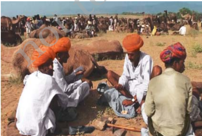
Fig.8 – A camel fair at Pushkar.

How did the life of pastoralists change under colonial rule?