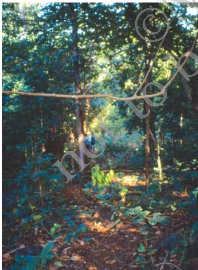
Fig. 1 – A sal forest in Chhattisgarh. Look at the different heights of the trees and plants in this picture, and the variety of species. This is a dense forest, so very little sunlight falls on the forest floor.

A lot of this diversity is fast disappearing. Between 1700 and 1995, the period of industrialisation, 13.9 million sq km of forest or 9.3 per cent of the world's total area was cleared for industrial uses, cultivation, pastures and fuelwood.