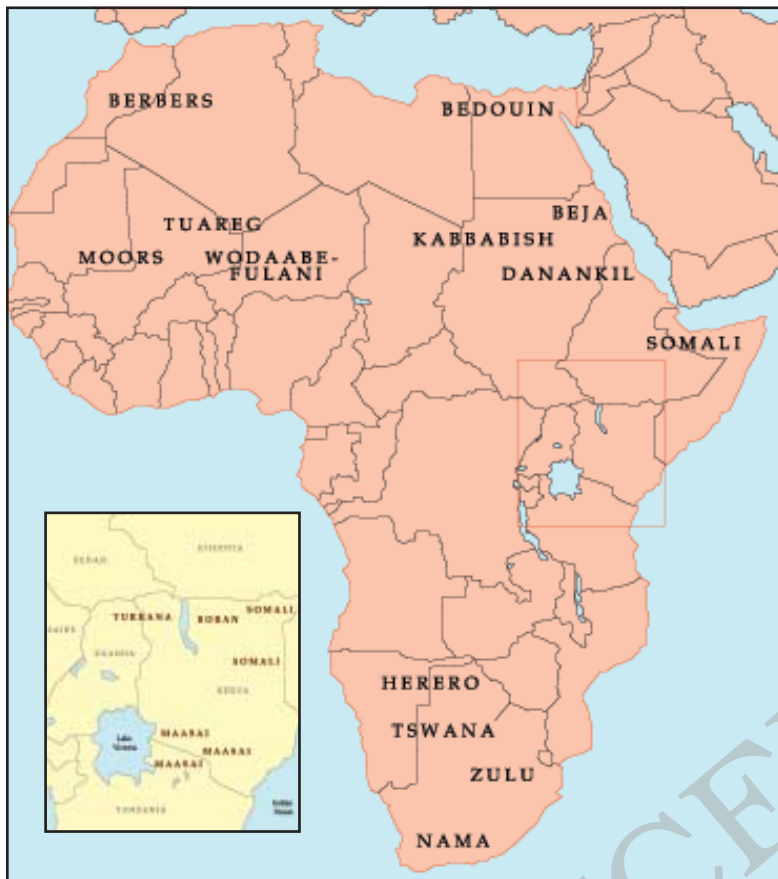
Fig. 13 – Pastoral communities in Africa. The inset shows the location of the Maasais in Kenya and Tanzania.

We will discuss some of these changes by looking at one pastoral community – the Maasai – in some detail. The Maasai cattle herders live primarily in east Africa: 300, 000 in southern Kenya and another 150,000 in Tanzania. We will see how new laws and regulations took away their land and restricted their movement. This affected their lives in times of drought and even reshaped their social relationships.