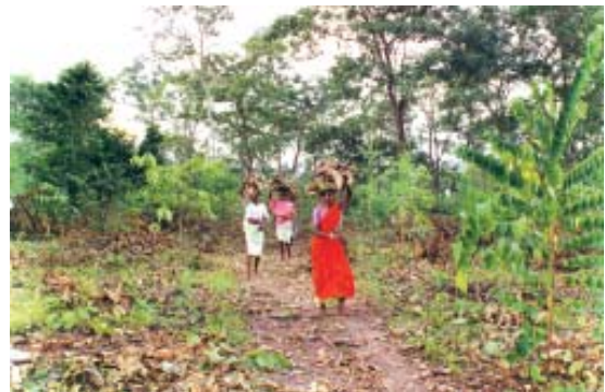
Fig. 6 - Women returning home after collecting fuelwood.