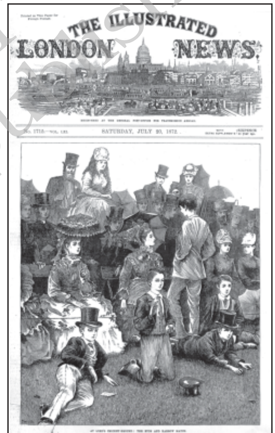
Fig. 7 – A cricket match at Lord's between the famous public schools Eton and Harrow.

Hierarchy – Organised by rank and status