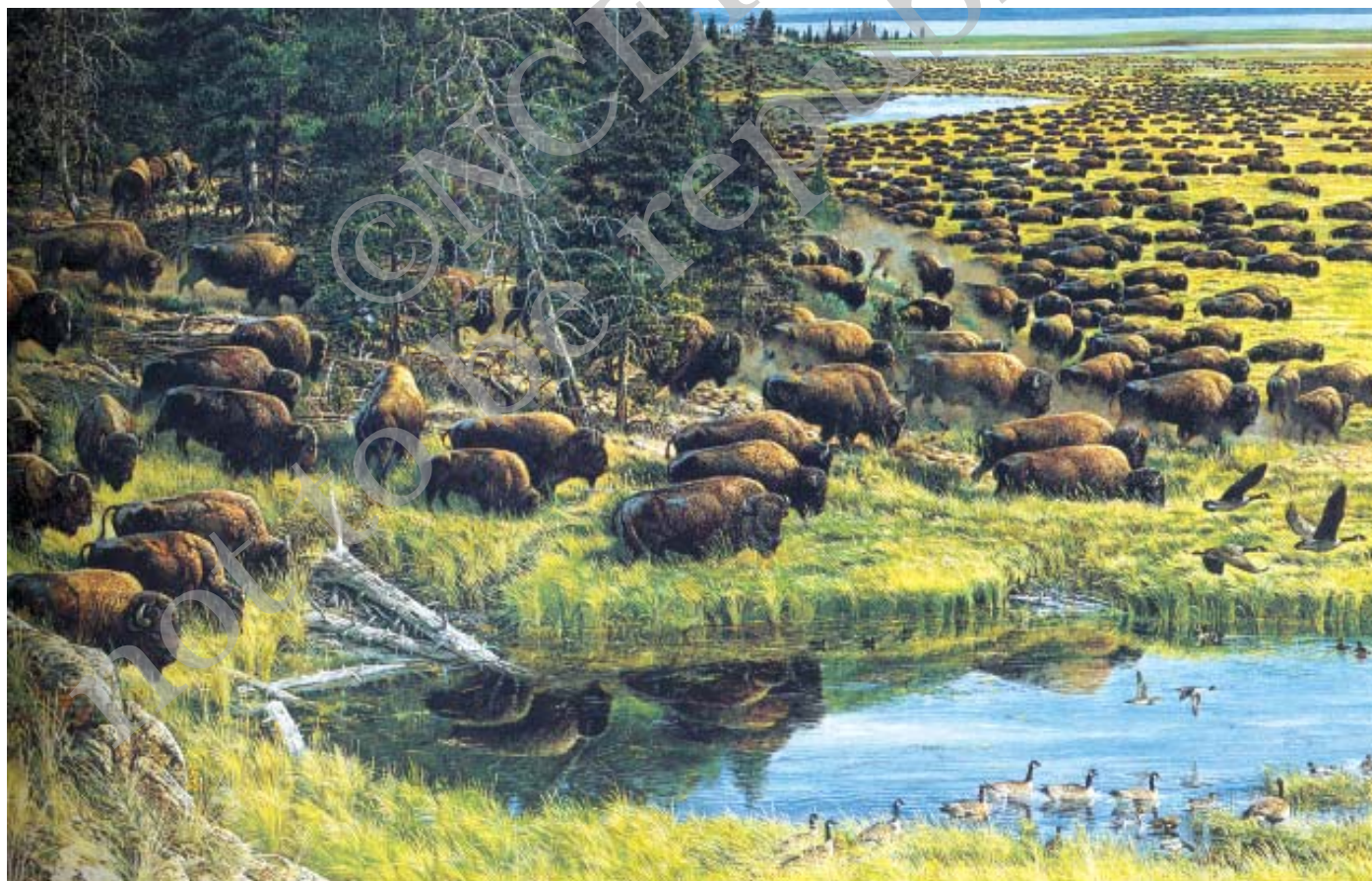
Fig.2 – When the valleys were full. Painting by John Dawson.

In 1600, approximately one-sixth of India's landmass was under cultivation. Now that figure has gone up to about half. As population increased over the centuries and the demand for food went up, peasants extended the boundaries of cultivation, clearing forests and breaking new land. In the colonial period, cultivation expanded rapidly for a variety of reasons. First, the British directly encouraged