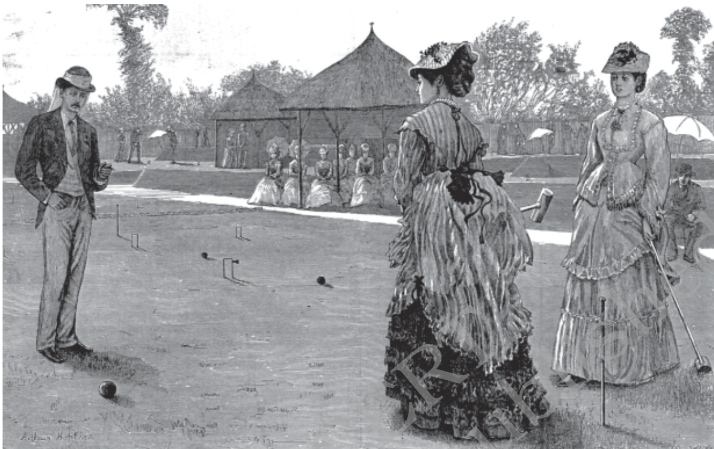
Fig.8 – Croquet, not cricket, for women.

Sports for women was not designed as vigorous, competitive exercise. Croquet was a slow-paced, elegant game considered suitable for women, especially of the upper class. The players' flowing gowns, frills and hats show the character of women's sports. From Illustrated London News, 20 July, 1872.