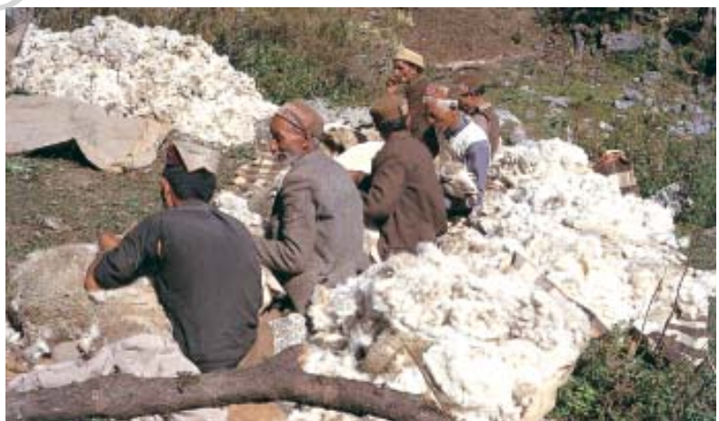
Fig.4 – Gaddi sheep being sheared.

Bugyal – Vast meadows in the high mountains