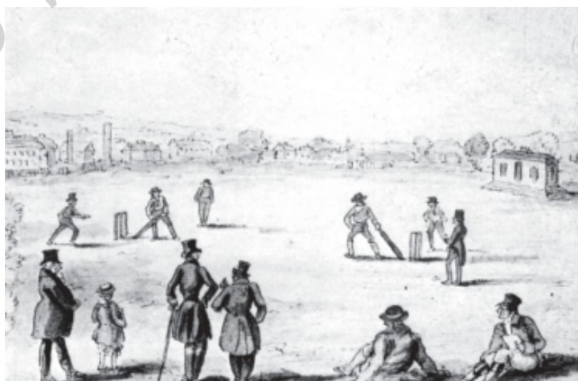
Fig. 2 – An artist's sketch of the cricket ground at Lord's in England in 1821.

Our history of cricket will look first at the evolution of cricket as a game in England, and discuss the wider culture of physical training and athleticism of the time. It will then move to India, discuss the history of the adoption of cricket in this country, and trace the modern transformation of the game. In each of these sections we will see how the history of the game was connected to the social history of the time.