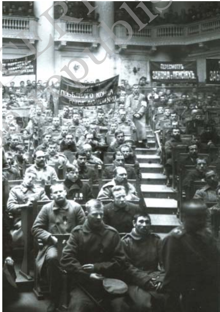
Fig.8 – The Petrograd Soviet meeting in the Duma, February 1917.

On Sunday, 25 February, the government suspended the Duma. Politicians spoke out against the measure. Demonstrators returned in force to the streets of the left bank on the 26th. On the 27th, the Police Headquarters were ransacked. The streets thronged with people raising slogans about bread, wages, better hours and democracy. The government tried to control the situation and called out the cavalry once again. However, the cavalry refused to fire on the demonstrators. An officer was shot at the barracks of a regiment and three other regiments mutinied, voting to join the striking workers. By that evening, soldiers and