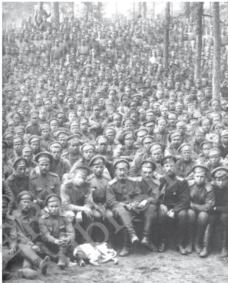
Fig. 7 – Russian soldiers during the First World War.

The war also had a severe impact on industry. Russia's own industries were few in number and the country was cut off from other suppliers of industrial goods by German control of the Baltic Sea. Industrial equipment disintegrated more rapidly in Russia than elsewhere in Europe. By 1916, railway lines began to break down. Able-bodied men were called up to the war. As a result, there were labour shortages and small workshops producing essentials were shut down. Large supplies of grain were sent to feed the army. For the people in the cities, bread and flour became scarce. By the winter of 1916, riots at bread shops were common.