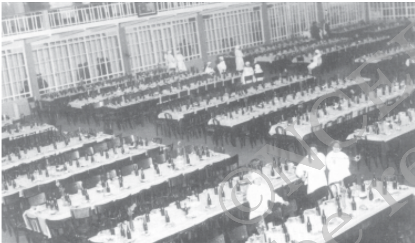
Fig. 17 – Factory dining hall in the 1930s.