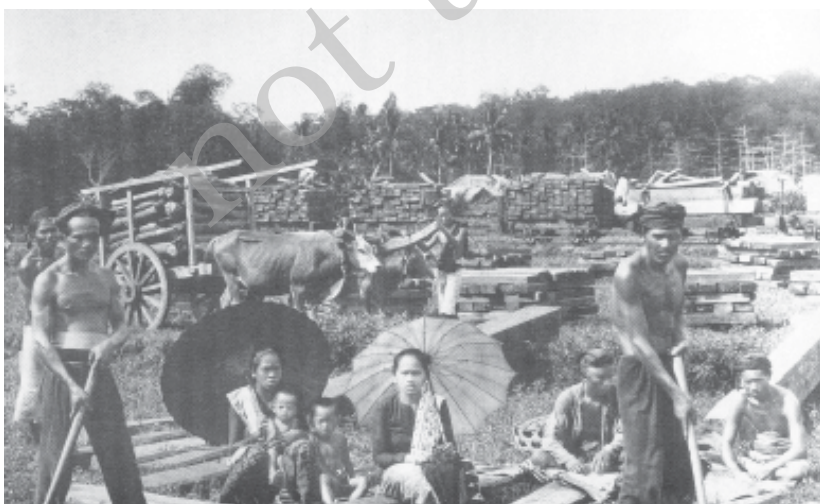
Fig.24 – Log yard in Rembang under Dutch colonial rule.

Since the 1980s, governments across Asia and Africa have begun to see that scientific forestry and the policy of keeping forest communities away from forests has resulted in many conflicts. Conservation of forests rather than collecting timber has become a more important goal. The government has recognised that in order to meet this goal, the people who live near the forests must be involved. In many cases, across India, from Mizoram to Kerala, dense forests have survived only because villages protected them in sacred groves known as sarnas , devarakudu , kan , rai , etc. Some villages have been patrolling their own forests, with each household taking it in turns, instead of leaving it to the forest guards. Local forest communities and environmentalists today are thinking of different forms of forest management.