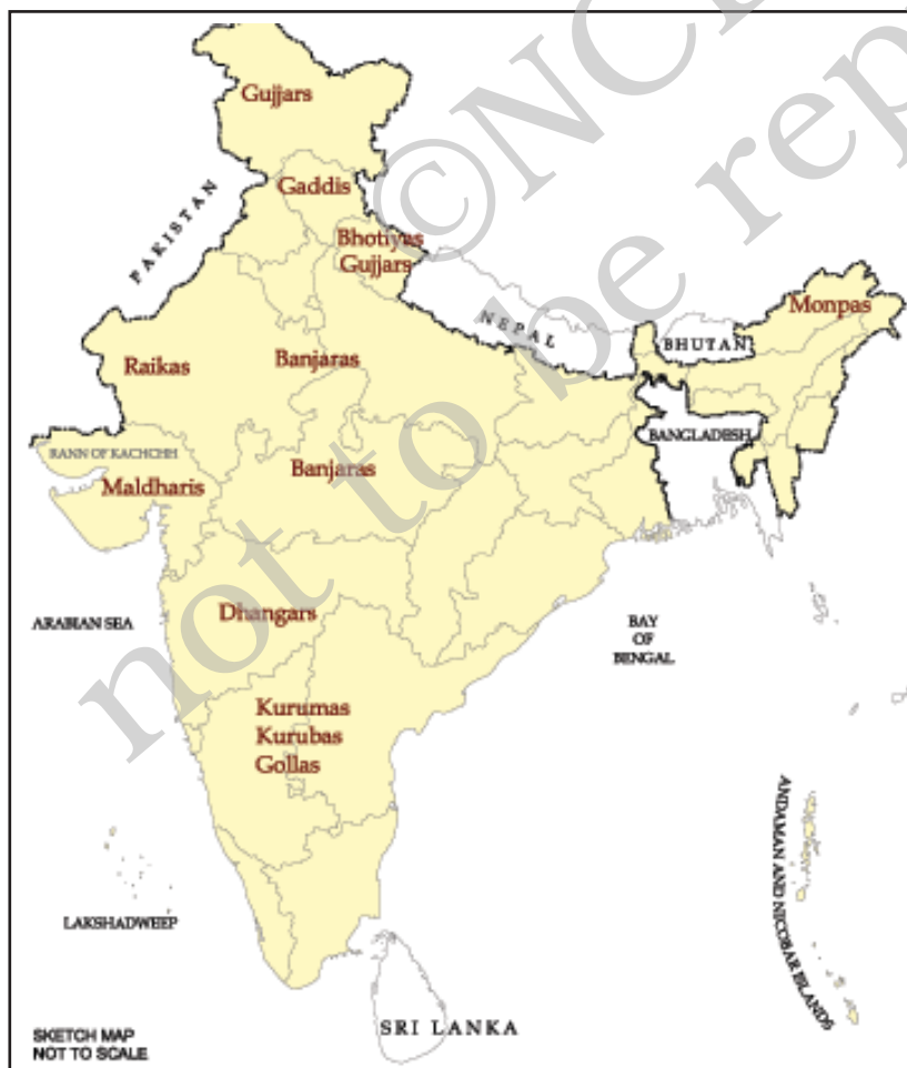
Fig. 11 – Pastoralists in India.

As pasturelands disappeared under the plough, the existing animal stock had to feed on whatever grazing land remained. This led to continuous intensive grazing of these pastures. Usually nomadic pastoralists grazed their animals in one area and moved to another area. These pastoral movements allowed time for the natural restoration of vegetation growth. When restrictions were imposed on pastoral movements, grazing lands came to be continuously used and the quality of pastures declined. This in turn created a further shortage of forage for animals and the deterioration of animal stock. Underfed cattle died in large numbers during scarcities and famines.