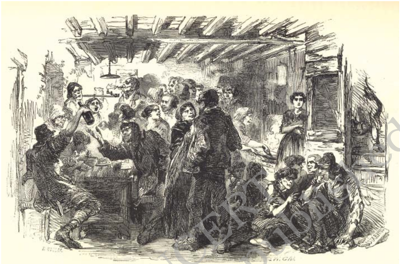
Fig. 1 – The London poor in the mid-nineteenth century as seen by a contemporary.

From: Henry Mayhew, London Labour and the London Poor , 1861.