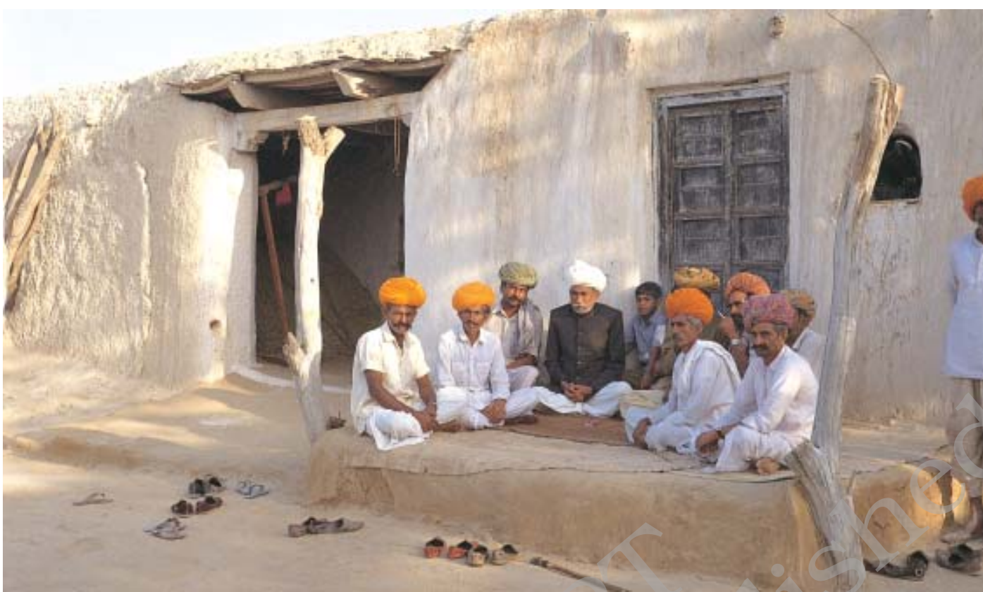
Fig.9 – A Maru Raika genealogist with a group of Raikas.

The genealogist recounts the history of the community. Such oral traditions give pastoral groups their own sense of identity. These oral traditions can tell us about how a group looks at its own past.