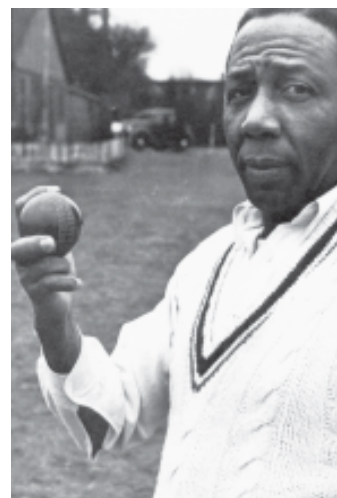
Fig. 12 – Learie Constantine. One of the best-known cricketers of the West Indies.