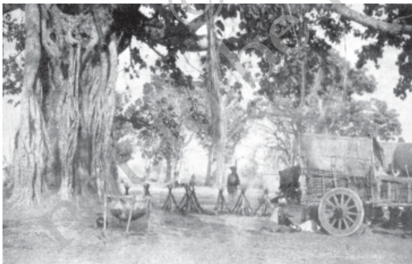
Fig.19 – Army camp in Bastar, 1910.

In 1947 Bastar kingdom was merged with Kanker kingdom and become Bastar district in Madhya Pradesh. In 1998 it was divided again into three districts, Kanker, Bastar and Dantewada. In 2001, these became part of Chhattisgarh. The 1910 rebellion first started in the Kanger forest area (encircled) and soon spread to other parts of the state.