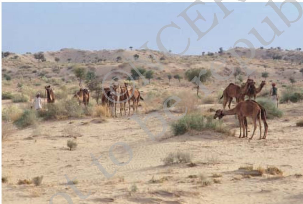
Fig.5 – Raika camels grazing on the Thar desert in western Rajasthan.

Dhangars were an important pastoral community of Maharashtra. In the early twentieth century their population in this region was estimated to be 467,000. Most of them were shepherds, some were blanket weavers, and still others were buffalo herders. The Dhangar shepherds stayed in the central plateau of Maharashtra during the monsoon. This was a semi-arid region with low rainfall and poor soil. It was covered with thorny scrub. Nothing but dry crops like bajra could be sown here. In the monsoon this tract became a vast grazing ground for the Dhangar flocks. By October the Dhangars harvested their bajra and started on their move west. After a march of about a month they reached the Konkan. This was a flourishing agricultural tract with high rainfall and rich soil. Here the shepherds