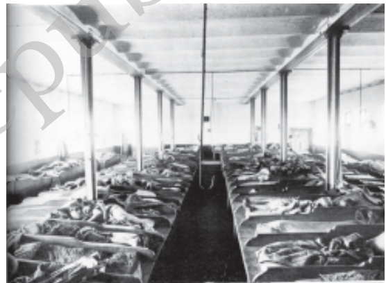
Fig.6 – Workers sleeping in bunkers in a dormitory in pre-revolutionary Russia. They slept in shifts and could not keep their families with them.