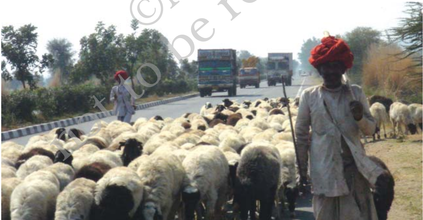
Fig. 18 – A Raika shepherd on Jaipur highway. Heavy traffic on highways has made migration of shepherds a new experience.

Yet, pastoralists do adapt to new times. They change the paths of their annual movement, reduce their cattle numbers, press for rights to enter new areas, exert political pressure on the government for relief, subsidy and other forms of support and demand a right in the management of forests and water resources. Pastoralists are not relics of the past. They are not people who have no place in the modern world. Environmentalists and economists have increasingly come to recognise that pastoral nomadism is a form of life that is perfectly suited to many hilly and dry regions of the world.