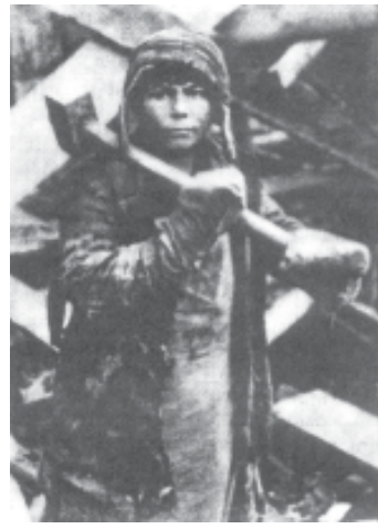
Fig. 16 – A child in Magnitogorsk during the First Five Year Plan. He is working for Soviet Russia.