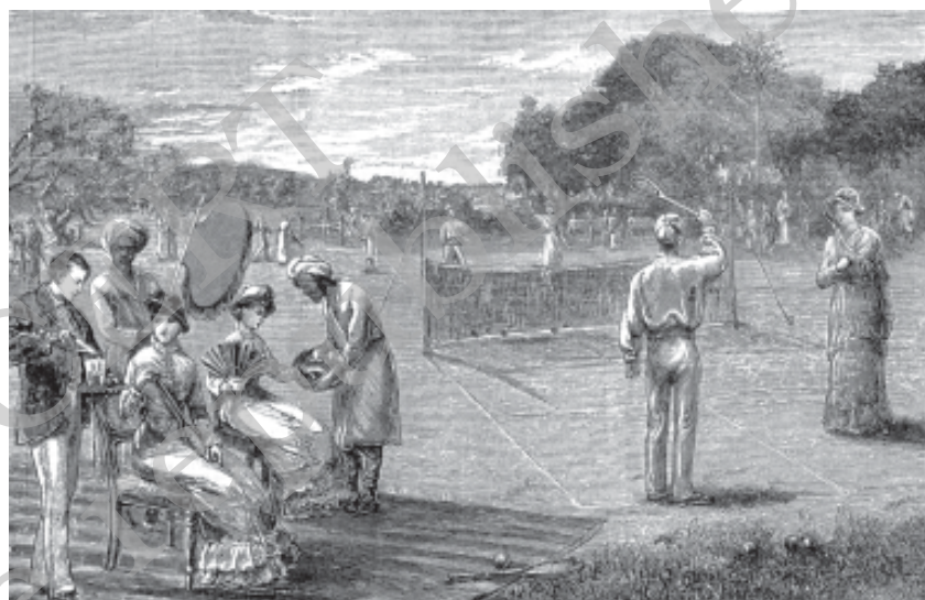
Fig.9 – An afternoon of tennis in the plains of colonial India. Notice how the artist tries to show that the game was for recreation as well as exercise. Men and women could play games together for recreation not competition. From: Graphic, February 1880.

While British imperial officials brought the game to the colonies, they made little effort to spread the game, especially in colonial territories where the subjects of empire were mainly non-white, such as India and the West Indies. Here, playing cricket became a sign of superior social and racial status, and the Afro-Caribbean population was discouraged from participating in organised club cricket, which remained dominated by white plantation owners and their servants. The first non-white club in the West Indies was established towards the end of the nineteenth century, and even in this case its members were light-skinned mulattos . So while black people played an enormous