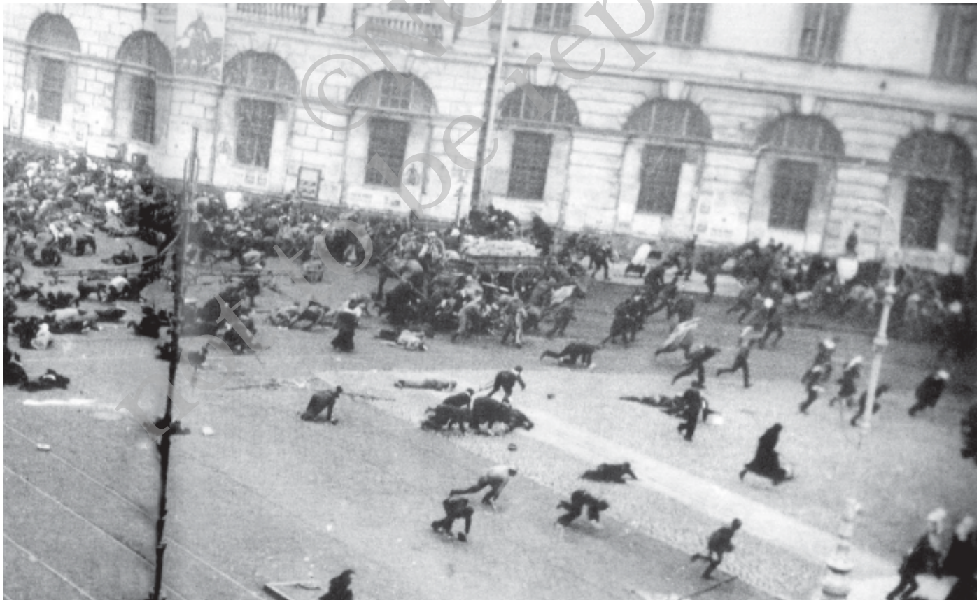
Fig.10 – The July Days . A pro-Bolshevik demonstration on 17 July 1917 being fired upon by the army.