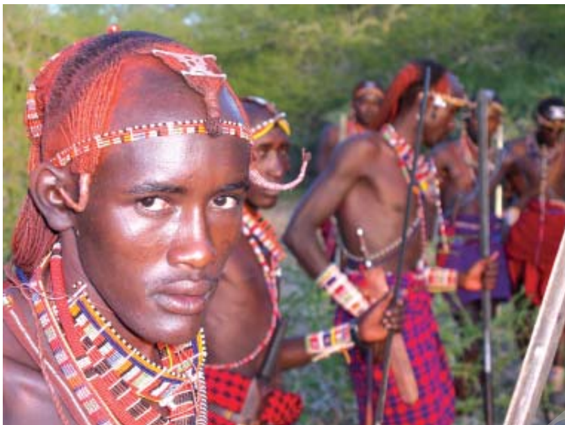
Fig. 17 - Even today, young men go through an elaborate ritual before they become warriors, although actually it is no longer common. They must travel throughout the section's region for about four months, ending with an event where they run to the homestead and enter with an attitude of a raider. During the ceremony, boys dress in loose clothing and dance non-stop throughout the day. This ceremony is the transition into a new age. Girls are not required to go through such a ritual.

To administer the affairs of the Maasai, the British introduced a series of measures that had important implications. They appointed chiefs of different sub-groups of Maasai, who were made responsible for the affairs of the tribe. The British imposed various restrictions on raiding and warfare. Consequently, the traditional authority of both elders and warriors was adversely affected.