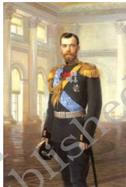
Fig. 3 – Tsar Nicholas II in the White Hall of the Winter Palace, St Petersburg, 1900. Painted by Earnest Lipgart (1847-1932)

In 1914, Tsar Nicholas II ruled Russia and its empire. Besides the territory around Moscow, the Russian empire included current-day Finland, Latvia, Lithuania, Estonia, parts of Poland, Ukraine and Belarus. It stretched to the Pacific and comprised today's Central Asian states, as well as Georgia, Armenia and Azerbaijan. The majority religion was Russian Orthodox Christianity – which had grown out of the Greek Orthodox Church – but the empire also included Catholics, Protestants, Muslims and Buddhists.