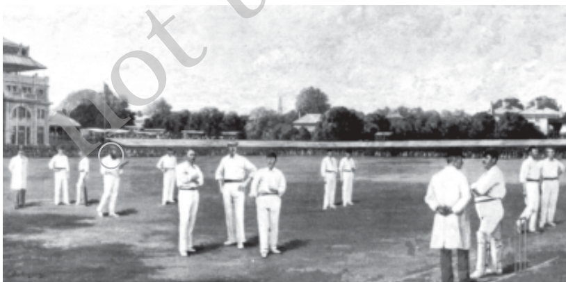
Fig. 6 – The legendary batsman W.G. Grace coming out to bat at Lord's in 1895. He was playing for the Gentlemen against the Players.

But in the matter of protective equipment, cricket has been influenced by technological change. The invention of vulcanised rubber led to the introduction of pads in 1848 and protective gloves soon afterwards, and the modern game would be unimaginable without helmets made out of metal and synthetic lightweight materials.