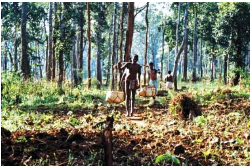
Fig. 14 – Bringing grain from the threshing grounds to the field.

The men are carrying grain in baskets from the threshing fields. Men carry the baskets slung on a pole across their shoulders, while women carry the baskets on their heads.