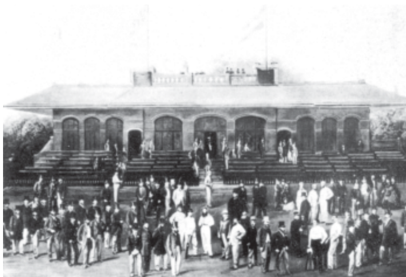
Fig.3 – The pavilion of the Marylebone Cricket Club (MCC) in 1874.

There's a historical reason behind both these oddities. Cricket was the earliest modern team sport to be codified, which is another way of saying that cricket gave itself rules and regulations so that it could be played in a uniform and standardised way well before team games like soccer and hockey. The first written 'Laws of Cricket' were drawn up in 1744. They stated, 'the principals shall choose from amongst the gentlemen present two umpires who shall absolutely decide all disputes. The stumps must be 22 inches high and the bail across them six inches. The ball must be between 5 and 6 ounces, and the two sets of stumps 22 yards apart'. There were no limits on the shape or size of the bat. It appears that 40 notches or runs was viewed as a very big score, probably due to the bowlers bowling quickly at shins unprotected by pads. The world's first cricket club was formed in Hambledon in the 1760s