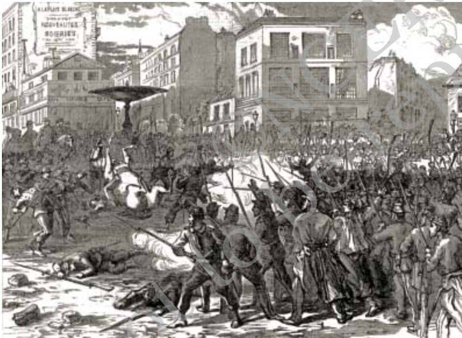
Fig.2 – This is a painting of the Paris Commune of 1871 (From Illustrated London News, 1871). It portrays a scene from the popular uprising in Paris between March and May 1871. This was a period when the town council (commune) of Paris was taken over by a ‘peoples’ government’ consisting of workers, ordinary people, professionals, political activists and others. The uprising emerged against a background of growing discontent against the policies of the French state. The ‘Paris Commune’ was ultimately crushed by government troops but it was celebrated by Socialists the world over as a prelude to a socialist revolution. The Paris Commune is also popularly remembered for two important legacies: one, for its association with the workers’ red flag – that was the flag adopted by the communards ( revolutionaries) in Paris; two, for the ‘Marseillaise’, originally written as a war song in 1792, it became a symbol of the Commune and of the struggle for liberty.