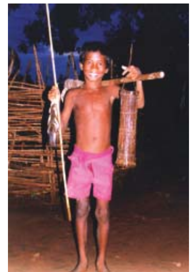
Fig. 17 – The little fisherman.

While the forest laws deprived people of their customary rights to hunt, hunting of big game became a sport. In India, hunting of tigers and other animals had been part of the culture of the court and nobility for centuries. Many Mughal paintings show princes and emperors enjoying a hunt. But under colonial rule the scale of hunting increased to such an extent that various species became almost extinct. The British saw large animals as signs of a wild, primitive and savage society. They believed that by killing dangerous animals the British