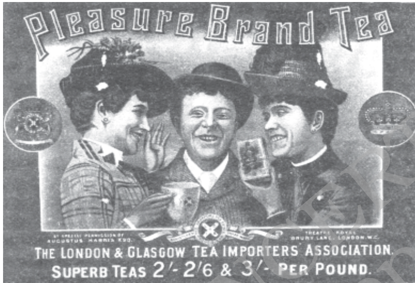
Fig.8 – Pleasure Brand Tea.

Large areas of natural forests were also cleared to make way for tea, coffee and rubber plantations to meet Europe's growing need for these commodities. The colonial government took over the forests, and gave vast areas to European planters at cheap rates. These areas were enclosed and cleared of forests, and planted with tea or coffee.