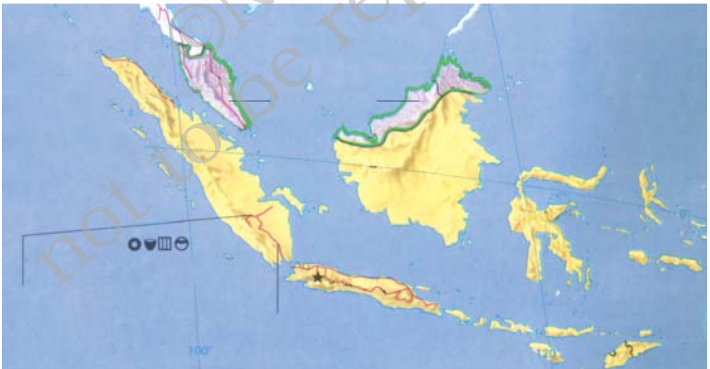
Fig. 22 – Most of Indonesia's forests are located in islands like Sumatra, Kalimantan and West Irian. However, Java is where the Dutch began their 'scientific forestry'. The island, which is now famous for rice production, was once richly covered with teak.

Dirk van Hogendorp, cited in Peluso, Rich Forests, Poor People , 1992.