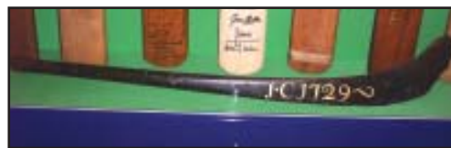
Fig. 1 – The oldest cricket bat in existence. Note the curved end, similar to a hockey stick.

Cricket grew out of the many stick-and-ball games played in England 500 years ago, under a variety of different rules. The word 'bat' is an old English word that simply means stick or club. By the seventeenth century, cricket had evolved enough to be recognisable as a distinct game and it was popular enough for its fans to be fined for playing it on Sunday instead of going to church. Till the middle of the eighteenth century, bats were roughly the same shape as hockey sticks, curving outwards at the bottom. There was a simple reason for this: the ball was bowled underarm, along the ground and the curve at the end of the bat gave the batsman the best chance of making contact.