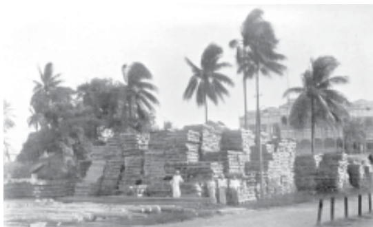
Fig.23 – Indian Munitions Board, War Timber Sleepers piled at Soolay pagoda ready for shipment, 1917.

The First World War and the Second World War had a major impact on forests. In India, working plans were abandoned at this time, and the forest department cut trees freely to meet British war needs. In Java, just before the Japanese occupied the region, the Dutch followed 'a scorched earth' policy, destroying sawmills, and burning huge piles of giant teak logs so that they would not fall into Japanese hands. The Japanese then exploited the forests recklessly for their own war industries, forcing forest villagers to cut down forests. Many villagers used this opportunity to expand cultivation in the forest. After the war, it was difficult for the Indonesian forest service to get this land back. As in India, people's need for agricultural land has brought them into conflict with the forest department's desire to control the land and exclude people from it.