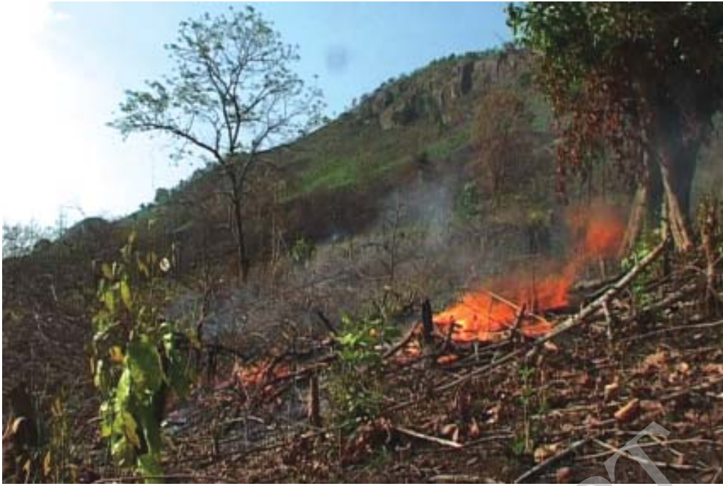
Fig. 16 – Burning the forest penda or podu plot.

In shifting cultivation, a clearing is made in the forest, usually on the slopes of hills. After the trees have been cut, they are burnt to provide ashes. The seeds are then scattered in the area, and left to be irrigated by the rain.