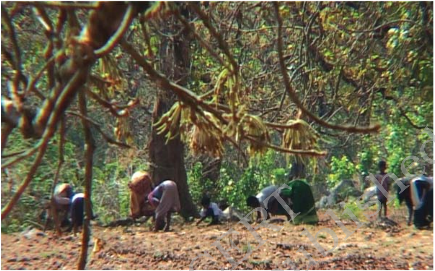
Fig. 12 – Collecting mahua ( Madhuca indica ) from the forests.

Villagers wake up before dawn and go to the forest to collect the mahua flowers which have fallen on the forest floor. Mahua trees are precious. Mahua flowers can be eaten or used to make alcohol. The seeds can be used to make oil.