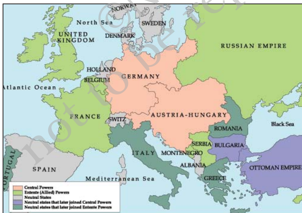
Fig. 4 – Europe in 1914.

The map shows the Russian empire and the European countries at war during the First World War.