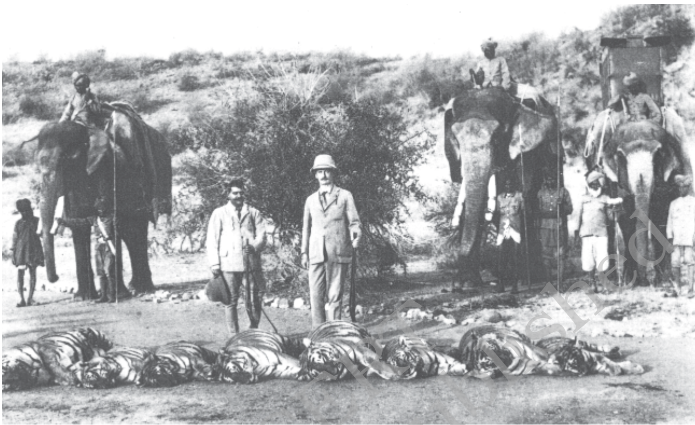
Fig. 18 – Lord Reading hunting in Nepal.

Count the dead tigers in the photo. When British colonial officials and Rajas went hunting they were accompanied by a whole retinue of servants. Usually, the tracking was done by skilled village hunters, and the Sahib simply fired the shot.