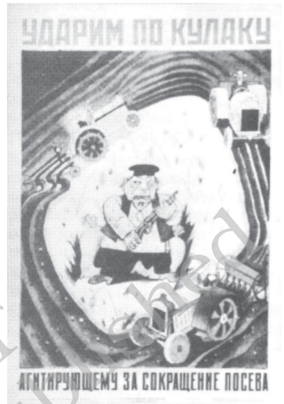
Fig. 18 – A poster during collectivisation. It states: 'We shall strike at the kulak working for the decrease in cultivation.'

Exiled – Forced to live away from one's own country.