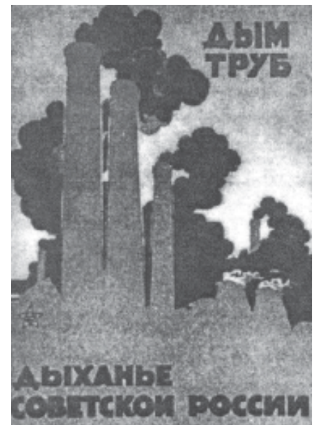
Fig. 14 – Factories came to be seen as a symbol of socialism. This poster states: 'The smoke from the chimneys is the breathing of Soviet Russia.'

An extended schooling system developed, and arrangements were made for factory workers and peasants to enter universities. Crèches were established in factories for the children of women workers. Cheap public health care was provided. Model living quarters were set up for workers. The effect of all this was uneven, though, since government resources were limited.