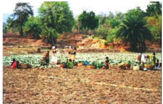
Fig. 13 – Drying tendu leaves.

The Forest Act meant severe hardship for villagers across the country. After the Act, all their everyday practices – cutting wood for their