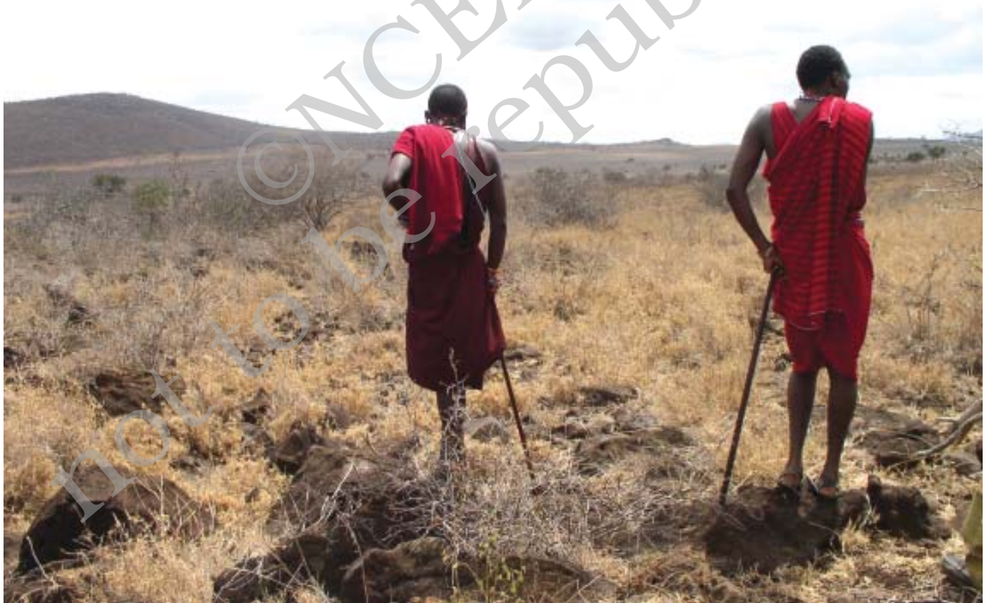
Fig. 14 – Without grass, livestock (cattle, goats and sheep) are malnourished, which means less food available for families and their children. The areas hardest hit by drought and food shortage are in the vicinity of Amboseli National Park, which last year generated approximately 240 million Kenyan Shillings (estimated $3.5 million US) from tourism. In addition, the Kilimanjaro Water Project cuts through the communities of this area but the villagers are barred from using the water for irrigation or for livestock.

Large areas of grazing land were also turned into game reserves like the Maasai Mara and Samburu National Park in Kenya and Serengeti Park in Tanzania. Pastoralists were not allowed to enter these reserves; they could neither hunt animals nor graze their herds in these areas. Very often these reserves were in areas that had traditionally been regular grazing grounds for Maasai herds. The Serengeti National Park, for instance, was created over 14,760 km. of Maasai grazing land.