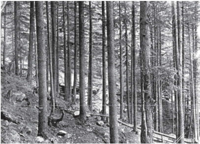
Fig. 10 – A deodar plantation in Kangra, 1933. From Indian Forest Records , Vol. XV.

punished. So Brandis set up the Indian Forest Service in 1864 and helped formulate the Indian Forest Act of 1865. The Imperial Forest Research Institute was set up at Dehradun in 1906. The system they taught here was called ‘ scientific forestry ’. Many people now, including ecologists, feel that this system is not scientific at all.