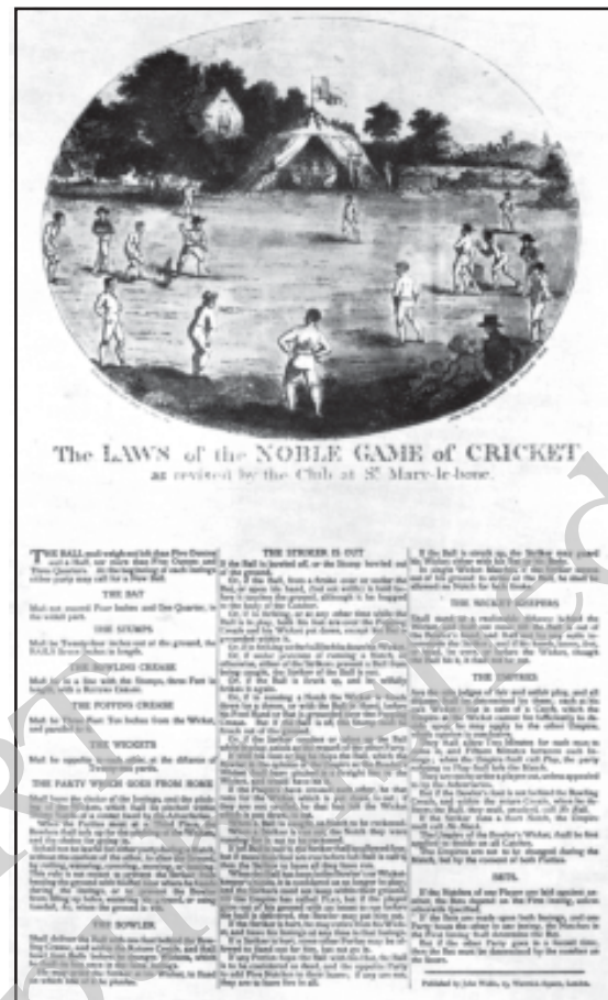
Fig.4 – The laws of cricket drawn up and revised by the MCC were regularly published in this form. Note that norms of betting were also formalised.

In the same way, cricket's vagueness about the size of a cricket ground is a result of its village origins. Cricket was originally played