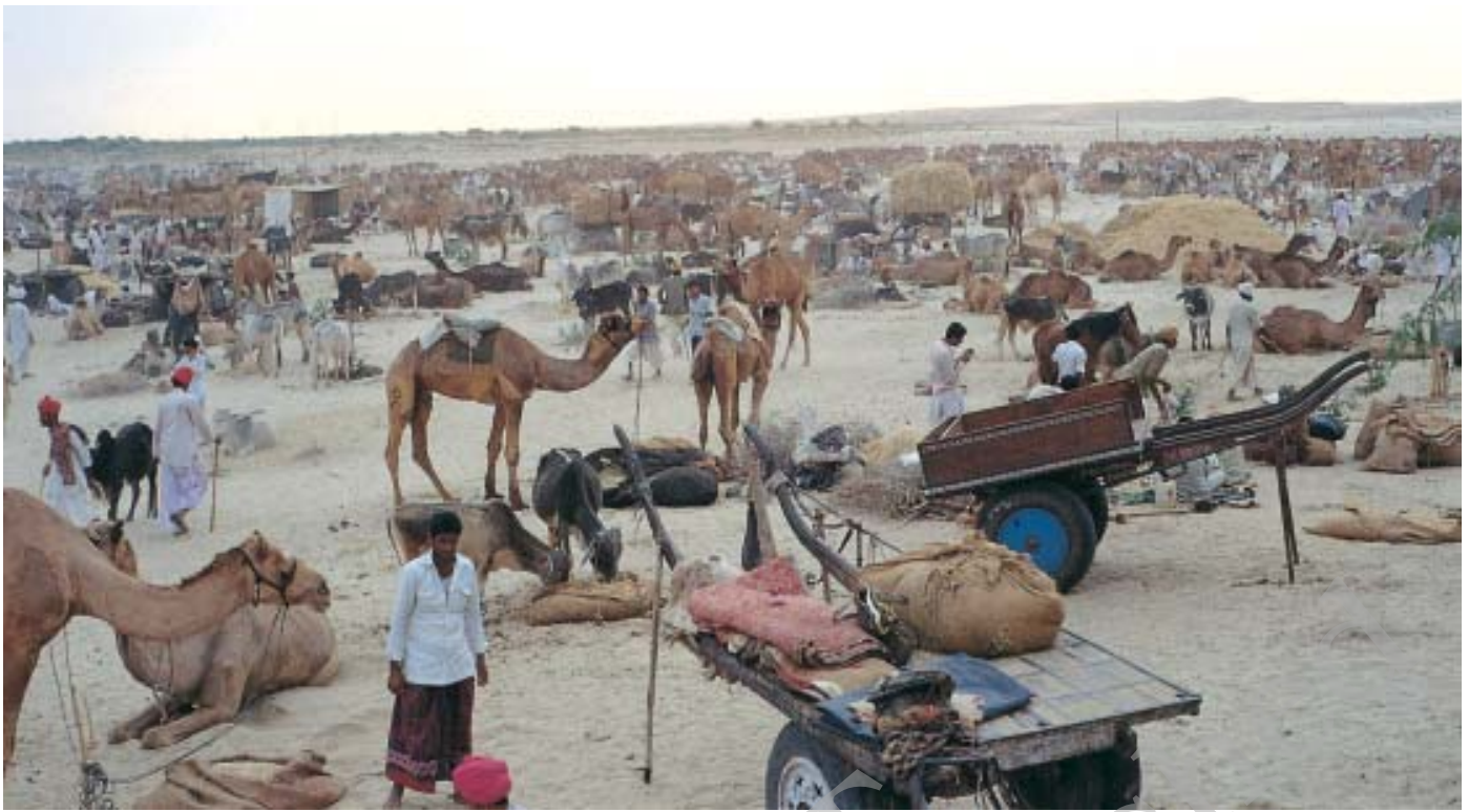
Fig.7 – A camel fair at Balotra in western Rajasthan. Camel herders come to the fair to sell and buy camels. The Maru Raikas also display their expertise in training their camels. Horses from Gujarat are also brought for sale at this fair.

So we see that the life of these pastoral groups was sustained by a careful consideration of a host of factors. They had to judge how long the herds could stay in one area, and know where they could find water and pasture. They needed to calculate the timing of their movements, and ensure that they could move through different territories. They had to set up a relationship with farmers on the way, so that the herds could graze in harvested fields and manure the soil. They combined a range of different activities – cultivation, trade, and herding – to make their living.