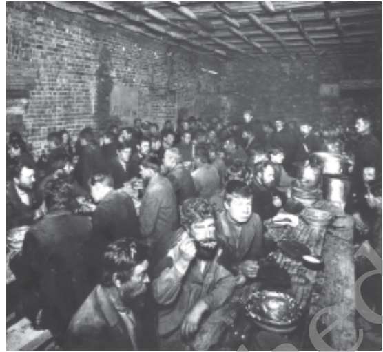
Fig.5 – Unemployed peasants in pre-war St Petersburg. Many survived by eating at charitable kitchens and living in poorhouses.

In the countryside, peasants cultivated most of the land. But the nobility, the crown and the Orthodox Church owned large properties. Like workers, peasants too were divided. They were also