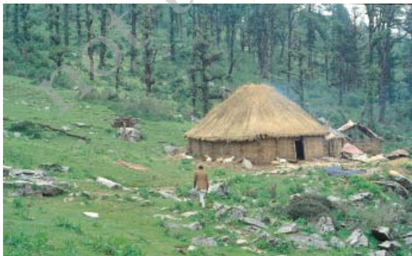
Fig.2 – A Gujjar Mandap on the high mountains in central Garhwal.

From: G.C. Barnes, Settlement Report of Kangra, 1850-55 .