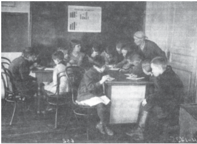
Fig. 15 – Children at school in Soviet Russia in the 1930s. They are studying the Soviet economy.