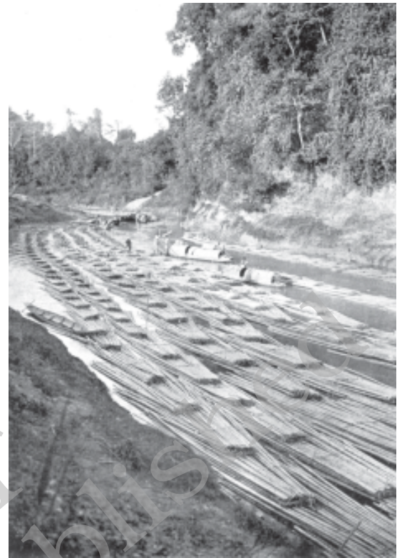
Fig.4 – Bamboo rafts being floated down the Kassalong river, Chittagong Hill Tracts.

From the 1860s, the railway network expanded rapidly. By 1890, about 25,500 km of track had been laid. In 1946, the length of the tracks had increased to over 765,000 km. As the railway tracks spread through India, a larger and larger number of trees were felled. As early as the 1850s, in the Madras Presidency alone, 35,000 trees were being cut annually for sleepers. The government gave out contracts to individuals to supply the required quantities. These contractors began cutting trees indiscriminately. Forests around the railway tracks fast started disappearing.